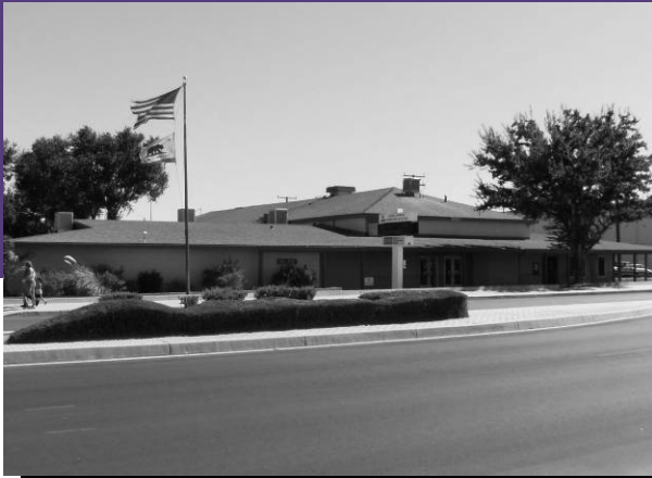
James Woody Community Center