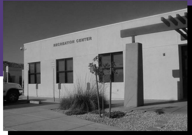
Town Hall Recreation Center

The James Woody Community Center and the Town Hall Recreation Center offer several rooms for individuals or community groups to rent for recreational and educational purposes, weddings, reunions and other celebrations. Several parks are also available for your next birthday or family picnic.