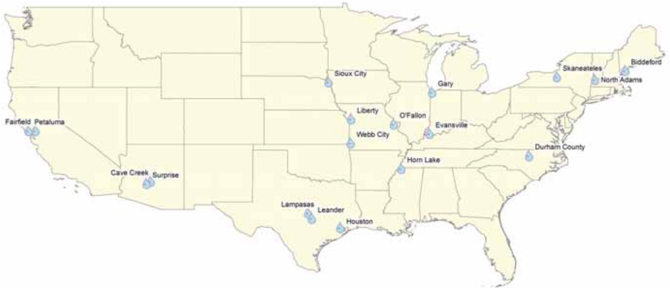
From 2007 to 2010, at least 18 local governments returned water and sewer systems to public hands to reduce costs.